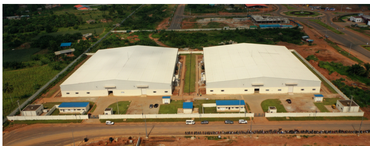
Garment Training Center (GTC)