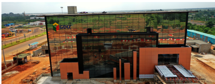
Single Window Clearance