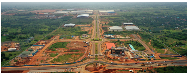
Panoramic view of the zone

Click here to watch a video on the development of GDIZ.