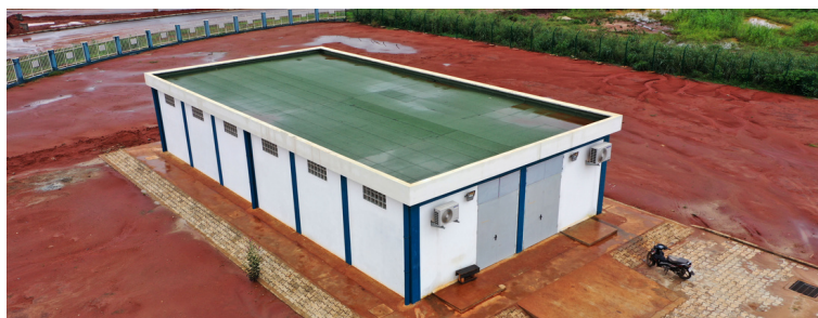
Zonal substation N°01