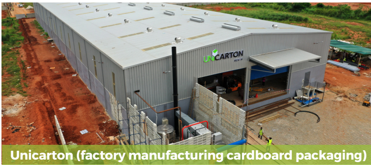
Unicarton (factory manufacturing cardboard packaging)