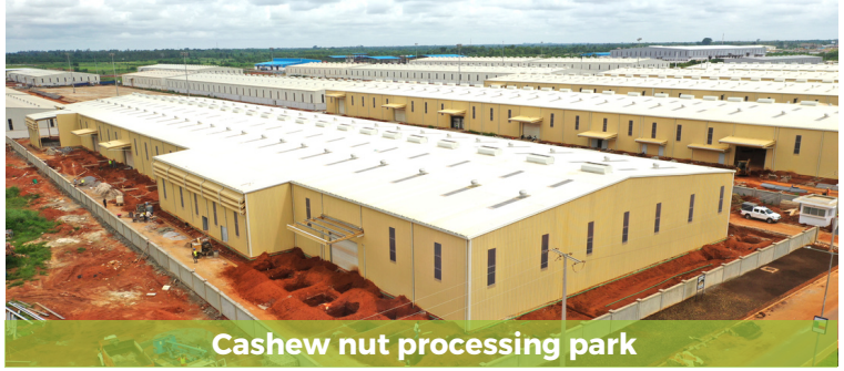
Cashew nut processing park