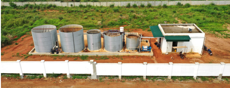
Common Effluent Treatment Plant