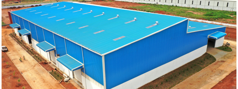
Benin Organics (organic soybean processing plant)