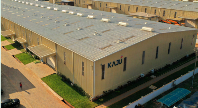
Kaju - Cashew nut processing plant

Explore the construction work progress of Glo-Djigbé Industrial Zone Zè-BENIN through these photos (taken in August 2023).