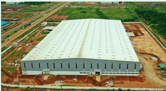
Spiro - Electric motorbike assembly plant