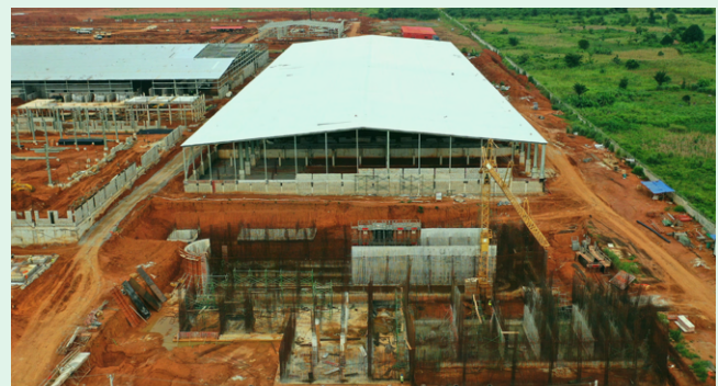
Afrikan Ceramics Solutions