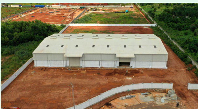
Confort meuble - Furniture manufacturing plant