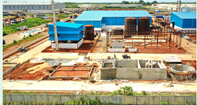
Benin Agribusiness - Soya processing plant